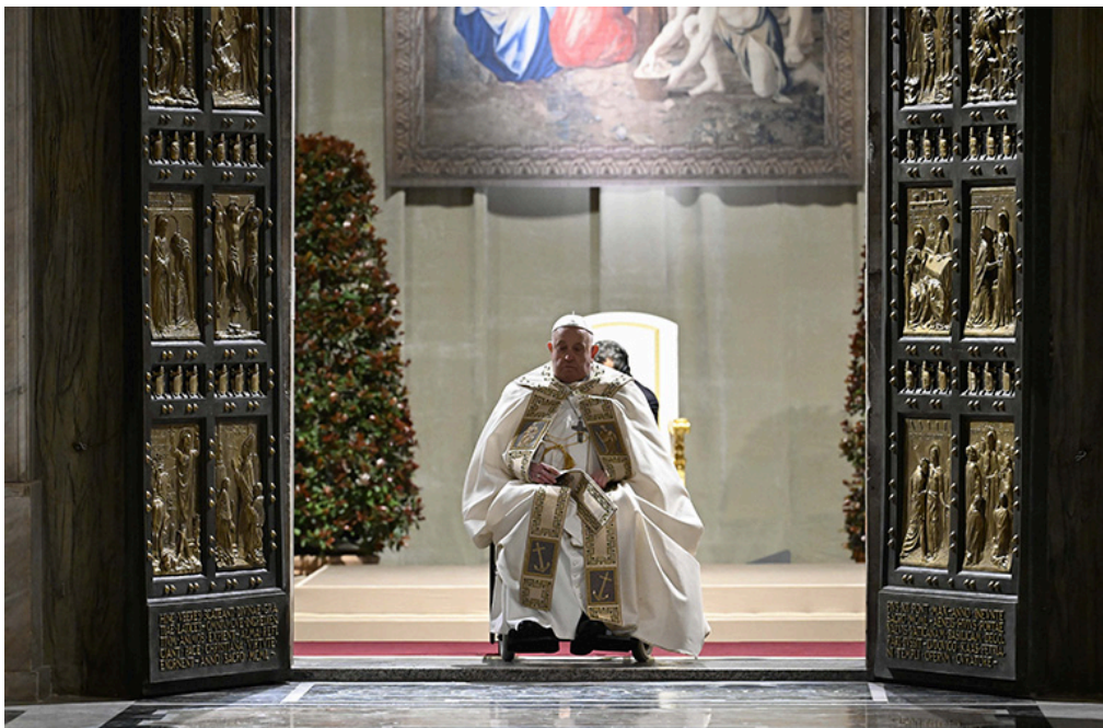
The Holy Father Pope Francis opens the Holy Doors for the Jubilee Year of 2025