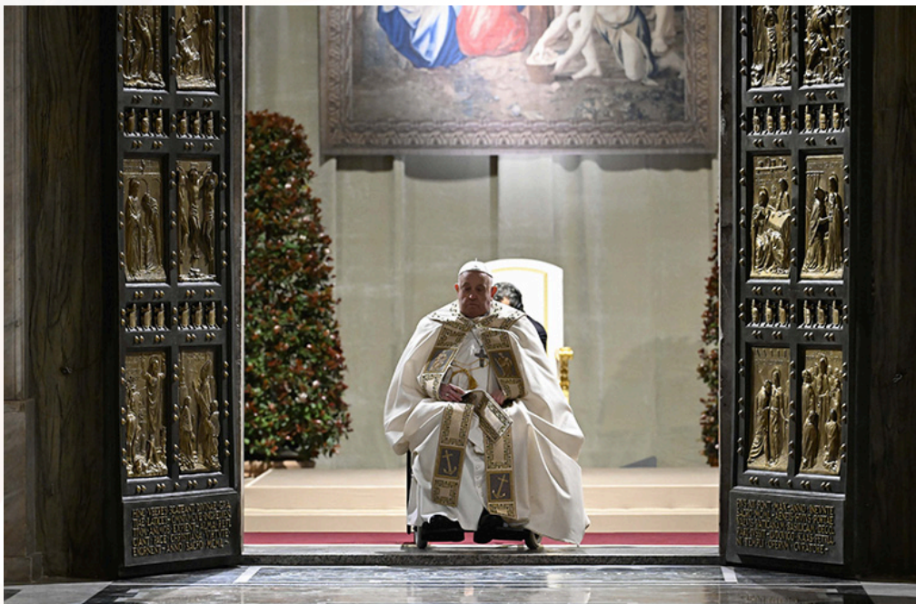
The Holy Father Pope Francis opens the Holy Doors for the Jubilee Year of 2025